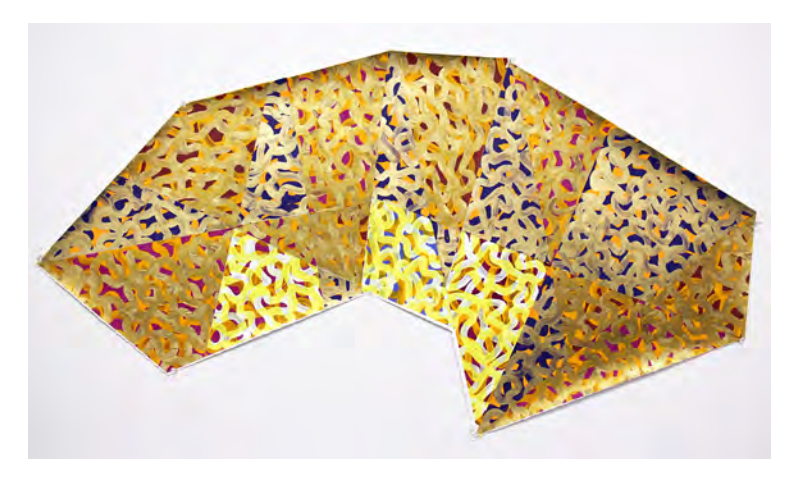
Untitled Gentrified Urban Skyline #2, 2018. Screenprint and ink on archival paper, dimensions variable.

CI: Okay. So, to me, at first these marks appeared to me as visual barriers to the collaged material underneath them, but the longer I look at these lines the more mesmerized I become and the more I can see in them, different things kind of vibrating and hovering. As I was thinking through this I became