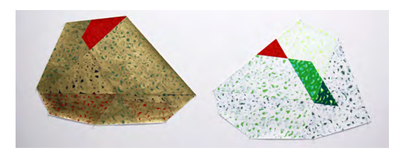
Left: Untitled Portrait of Racial Transcendence (From Cray to Ape-Shit), 2018. Screenprint and ink on archival paper, dimensions variable.

EMG: With some of the elements, some of the spaces and color combinations, I was really thinking about color theory and the idea of vibrating lines, like when certain colors start to meet, there's this vibration that goes on. But before that, one of the things I experimented with a long time ago was the idea of the monochromatic. People were like, well you have all these reds, and that's a blue that's involved with it -- that's not monochromatic, because it's a red. I think about how that blue can start to take on characteristics of the red. So it's like how we start to bring ourselves into certain communities and we--as opposed to changing the community, like 'oh, I'm new here, I bought this house, I need to change this community, can you guys not play dominoes on my sidewalk all night?'-- it's like, well maybe you need to do some research and figure out how you