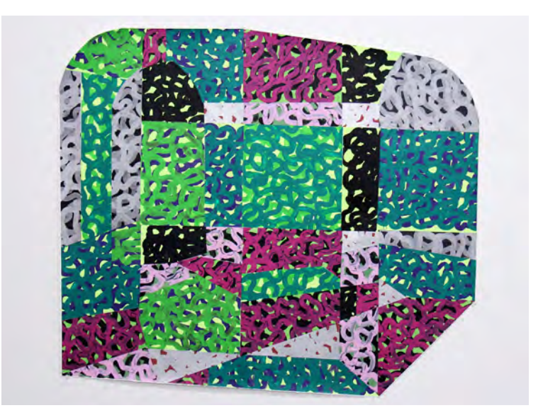
Untitled Original Landscape #1, 2018. Screenprint and ink on archival paper, dimensions variable.

*Front and back cover image: Untitled Original Landscape #1, 2018 (detail). Screenprint and ink on archival paper, dimensions variable.