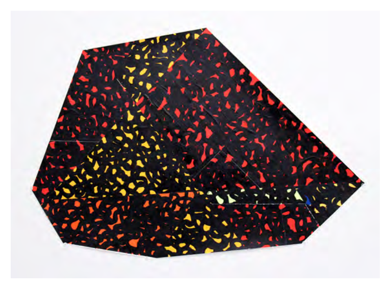
Untitled Portrait of Unconscious Racial Bias #1, In Remembrance of Your Feelings Left at The Alter, 2018. Screenprint and ink on archival paper, dimensions variable.