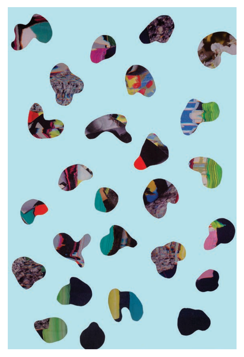
Eye Spots 1, 2019. Oil on inkjet printed cotton/linen, 48 x 32 inches.

plants cannot feel regret – a regret to have made itself stronger, a regret to have bloomed and been promiscuous, a regret to have appeared bigger and so on and so forth. In short, plants too can feel the urge to be a blue zebra, to be something else.